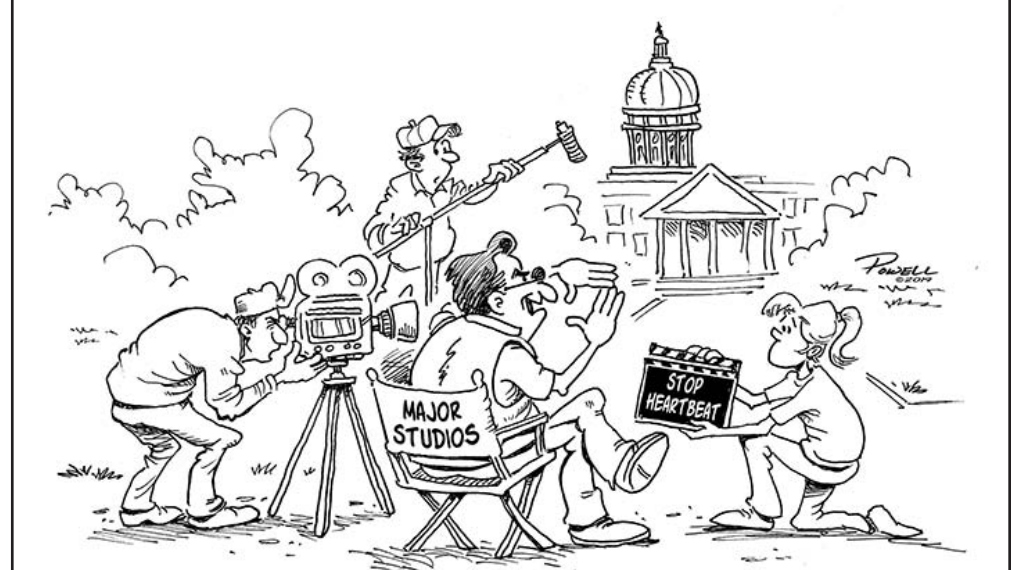
"Ok, in this scene we media giants tell the people of Georgia what beliefs we'll allow them to hold!"

Contact the Towns County Herald 706-896-4454